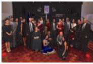
► NEW COMMITTEE IN PLACE FOR 2013 / 2014...1 & 12