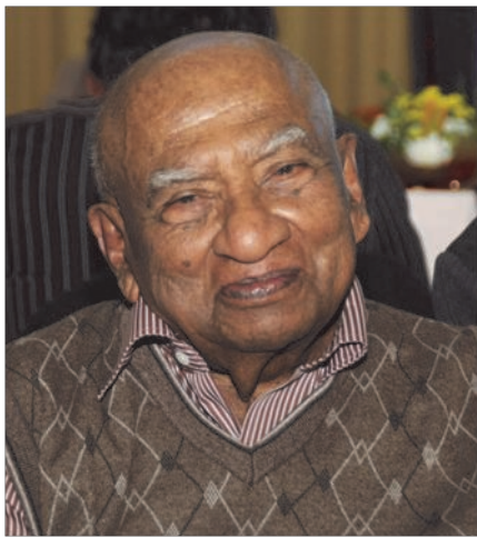
Still the young man at his 90 th birthday