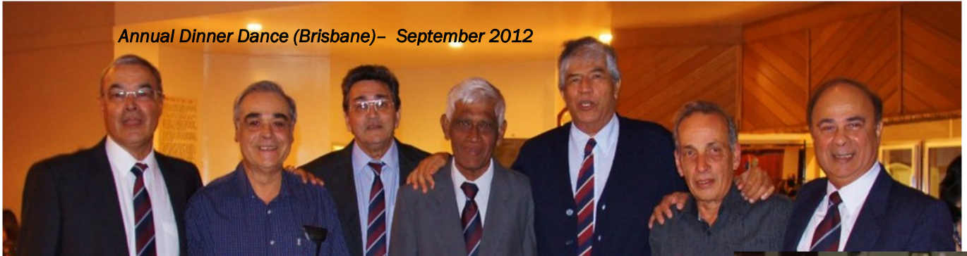
Annual Dinner Dance (Brisbane)– September 2012