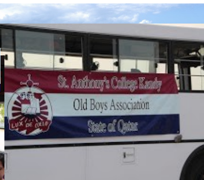
ANTONIAN OBA QATAR BEACH PARTY 2012